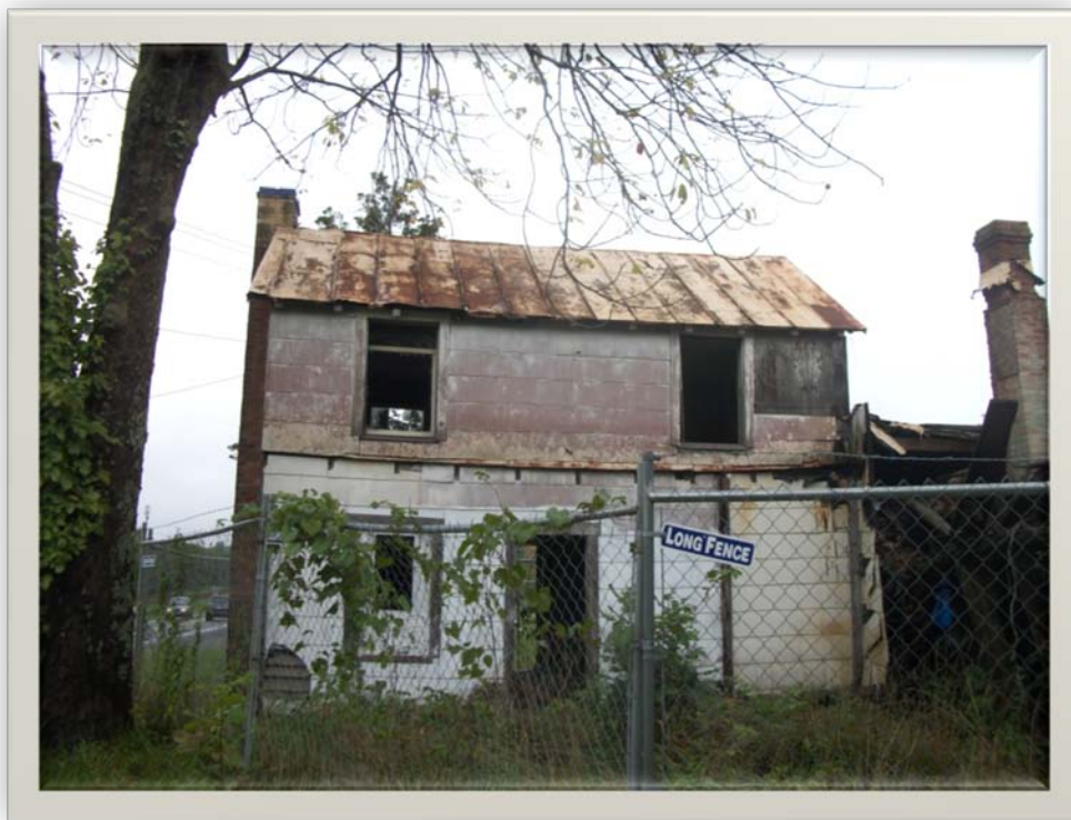
REAR VIEW OF STRUCTURE KOTD HOLDINGS ATTACHMENT 2 A-2