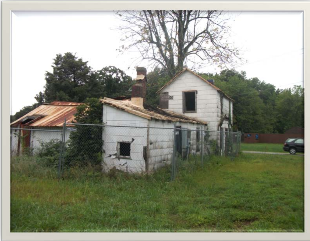
SIDE VIEW OF EXISTING UNOCCUPIED STRUCTURE