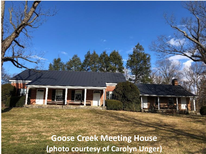
Goose Creek Meeting House

Goose Creek Meeting 18204 Lincoln Road, Purcellville, VA