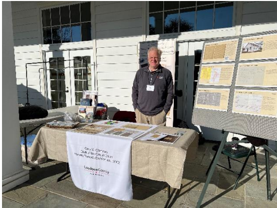
Historic Records Manager at the 2022 Waterford Fair