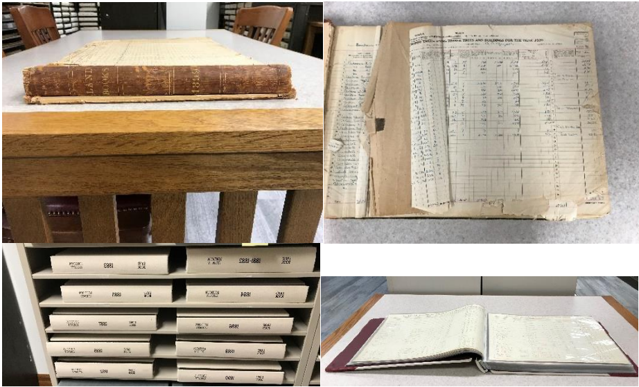
Land Tax Books Before and After Conservation