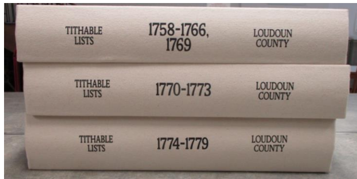
Tithable conserved in 2021 with grants from the Library of Virginia and the Kectoctin Chapter of the Daughters of the American Revolution