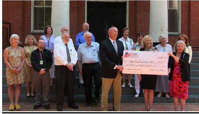
Clerk of the Circuit Court receiving a grant check from the Ketoctin Chapter of the Daughters of the American Revolution, July 2021